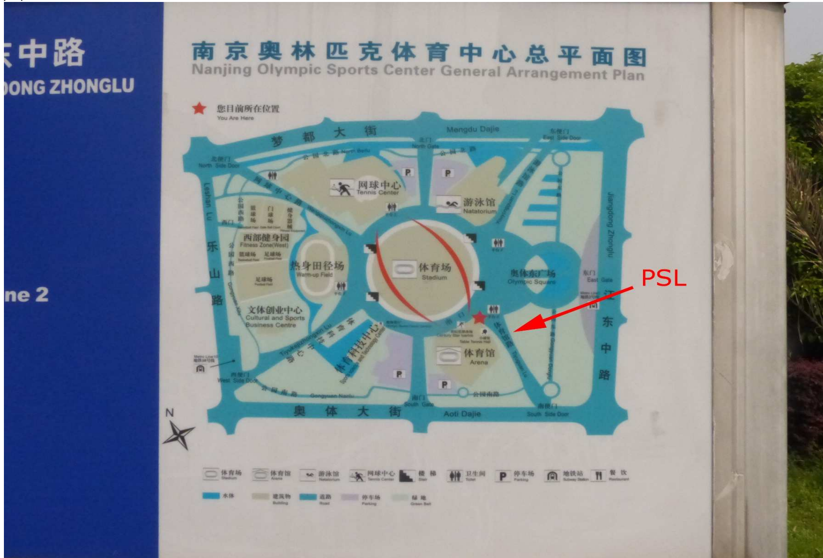
4 Map of Olympic Park