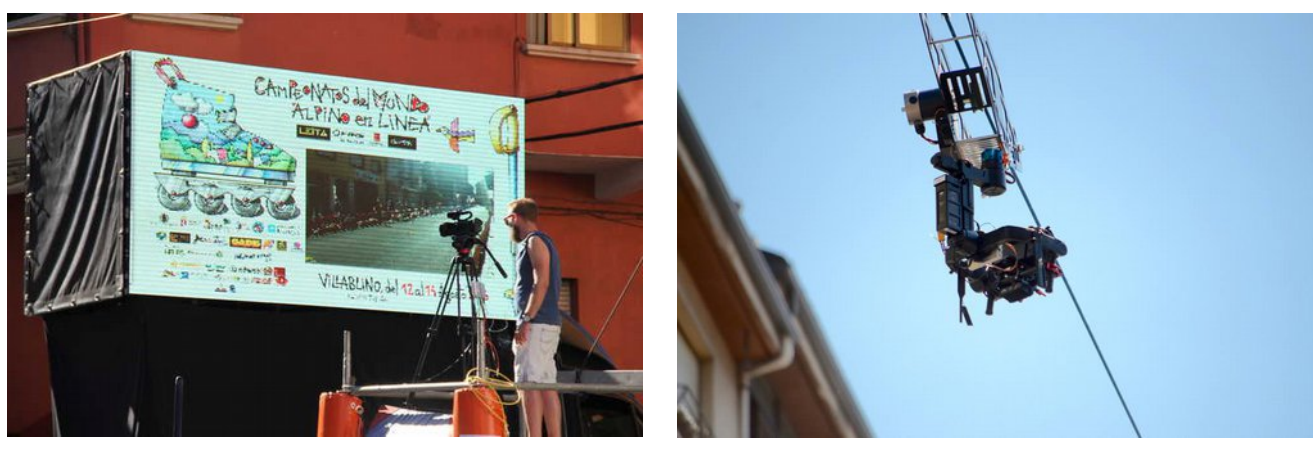
Big Screen and Camera