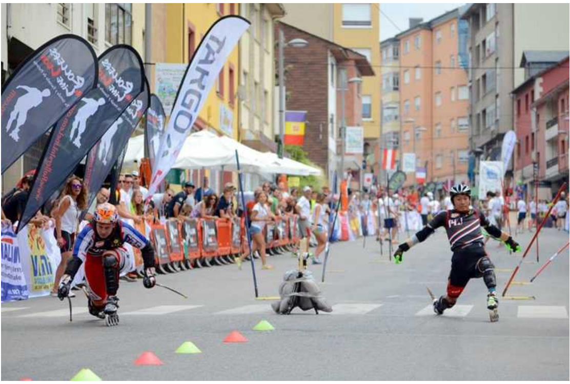
Parallel Slalom 2016

In 2015, this town organized, with great success, one race of the Inline Alpine World Cup; in 2016, the Giant & Team Race World Championships and, also, the World Cup Final and Parallel Slalom; and, in 2017, it will host European Championships and, also, one race of the World Cup.