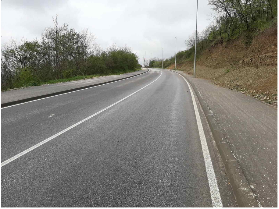
Start up hill